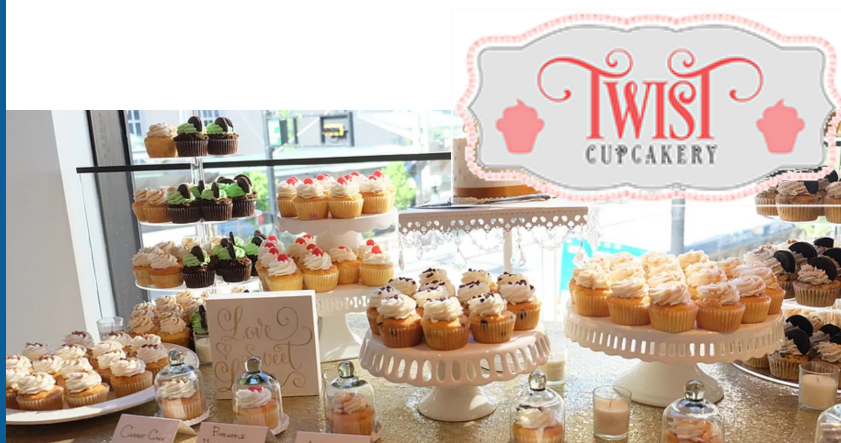
Twist Cupcakery, in Dayton, received a