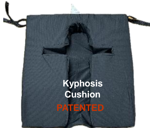
Kyphosis Cushion PATENTED