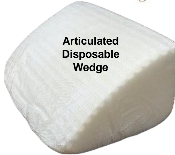
Articulated Disposable Wedge