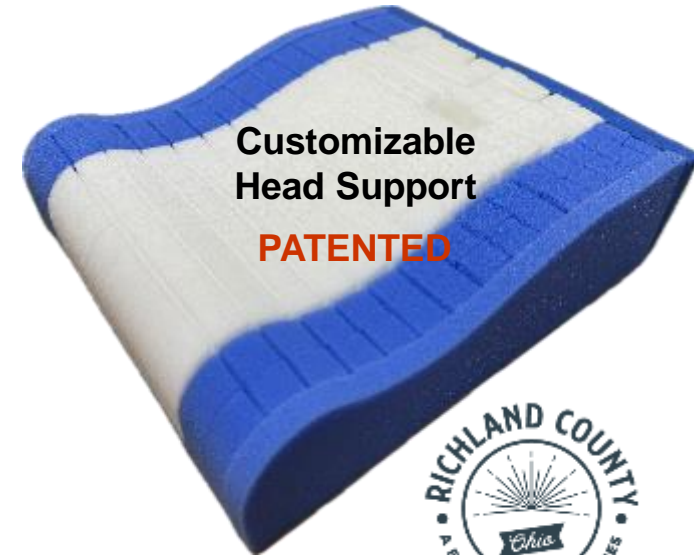
Customizable Head Support PATENTED