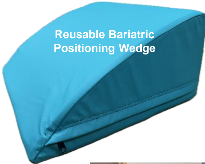
Reusable Bariatric Positioning Wedge