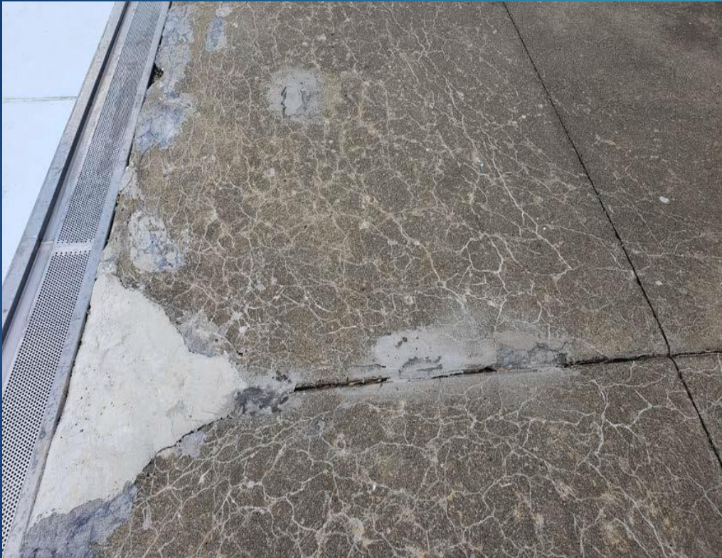
Parks and Recreation Before