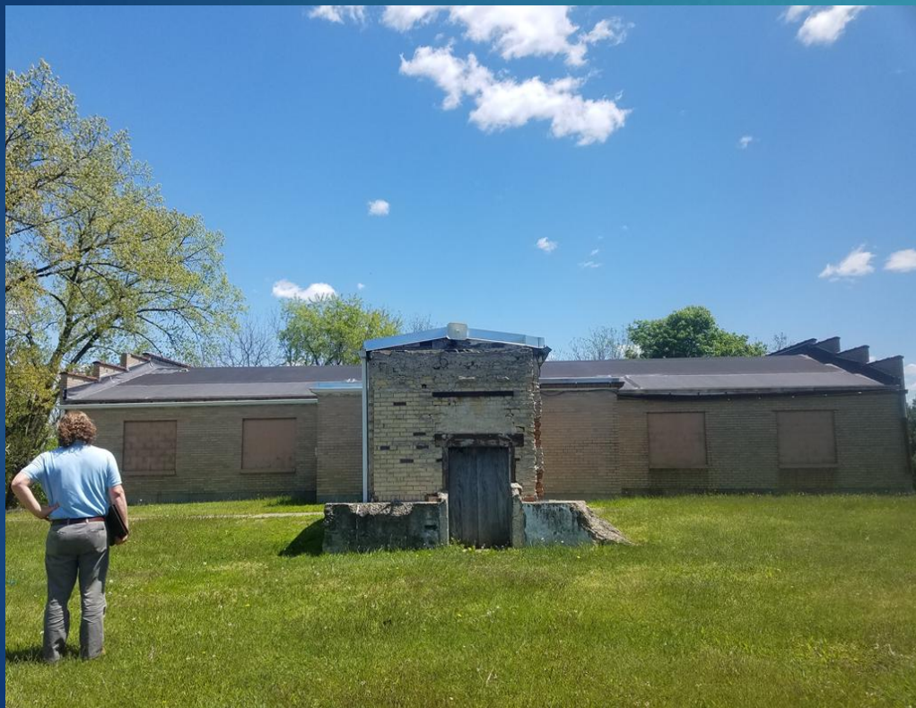
Community Center Before