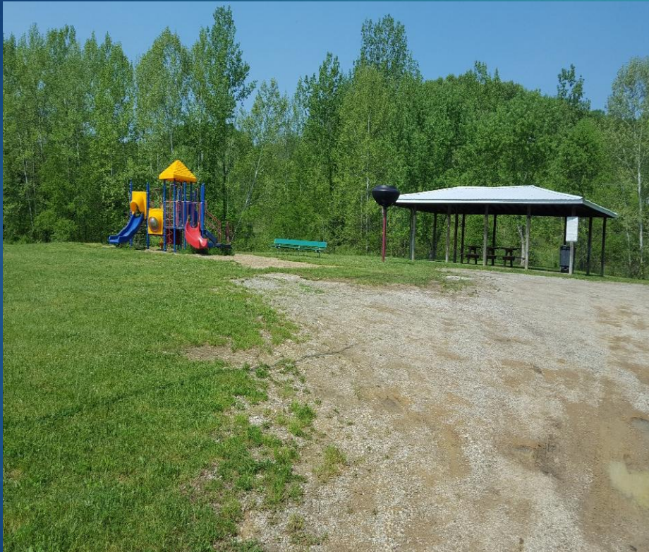
Parks and Recreation Before