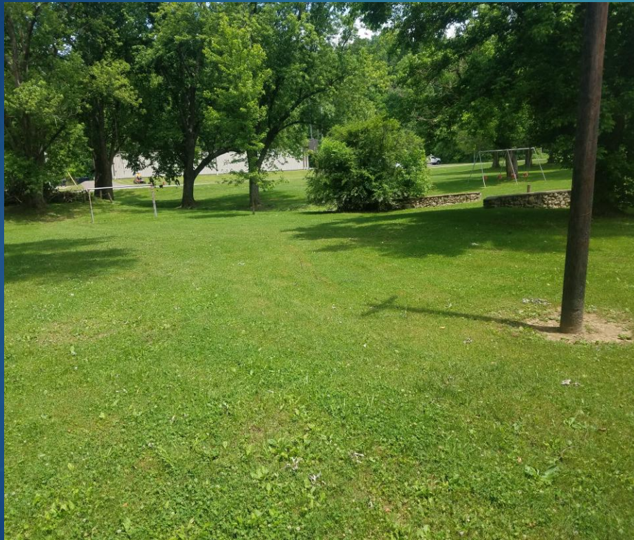
Parks and Recreation Before