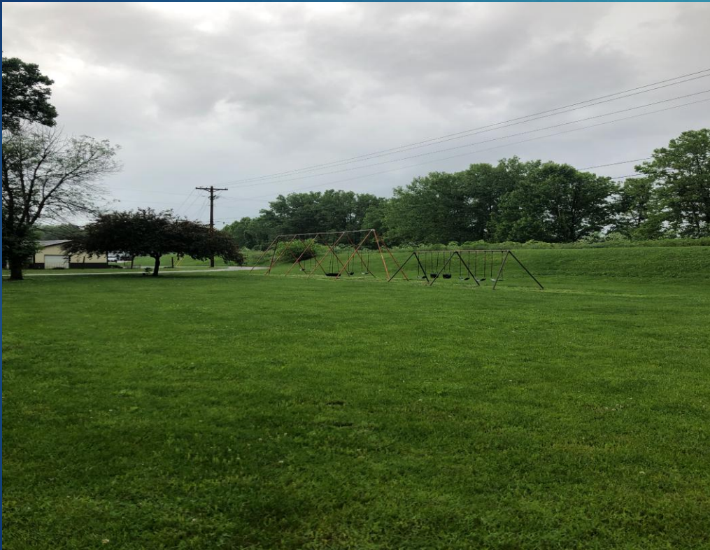
Parks and Recreation Before