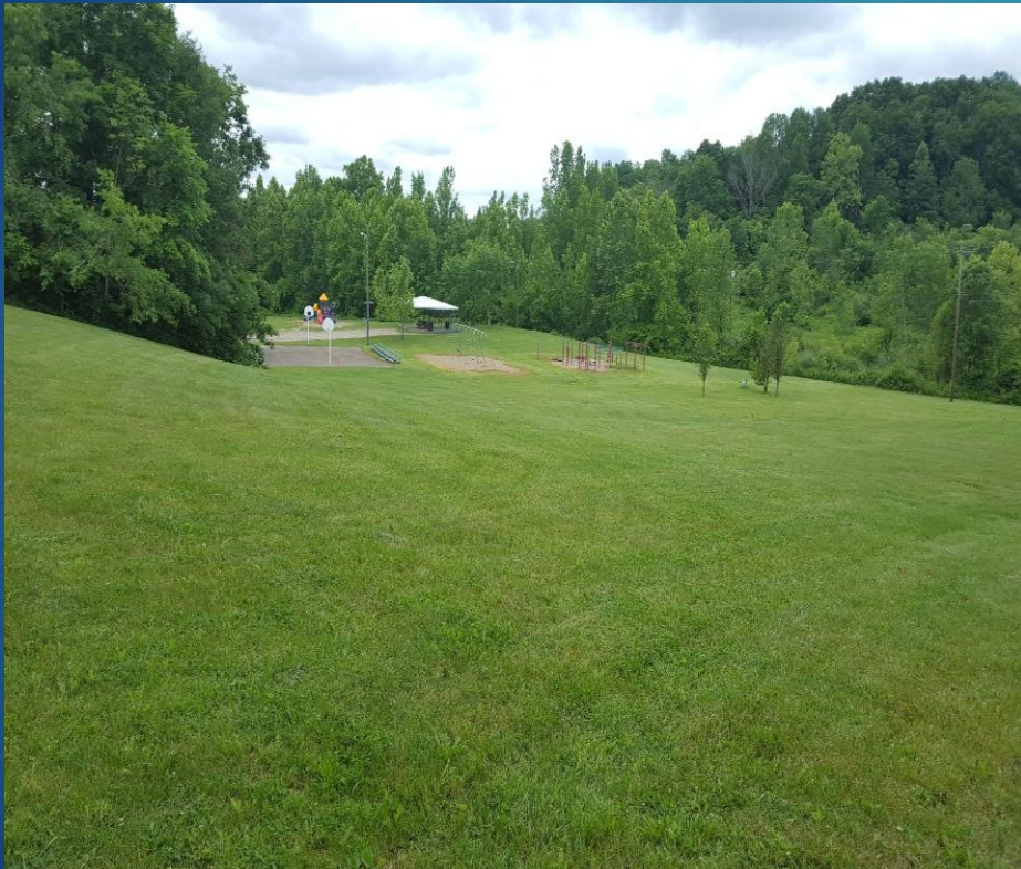
Parks and Recreation Before