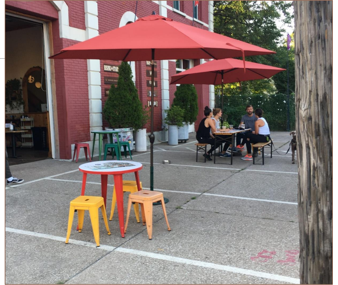
ADA-compliant and inclusive design