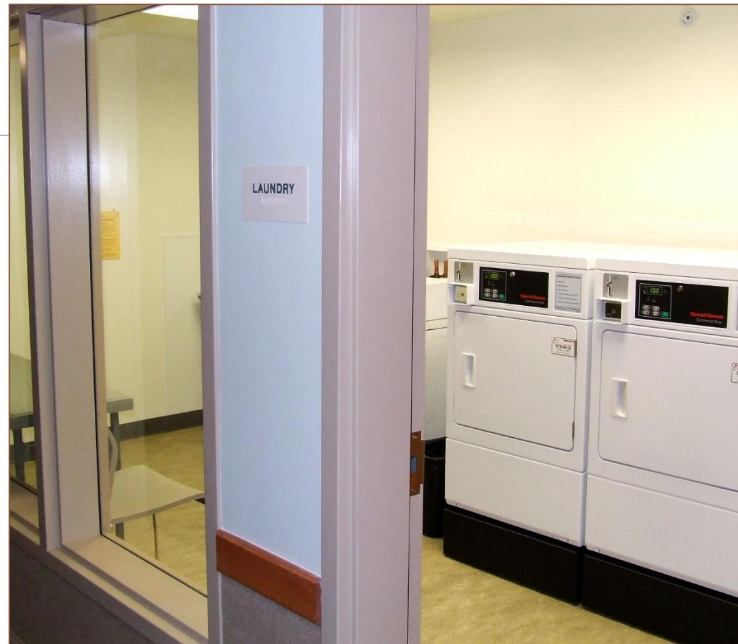
Fully accessible unit