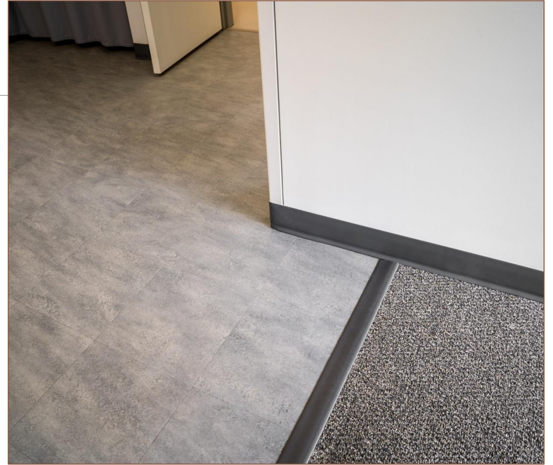
Fully accessible unit