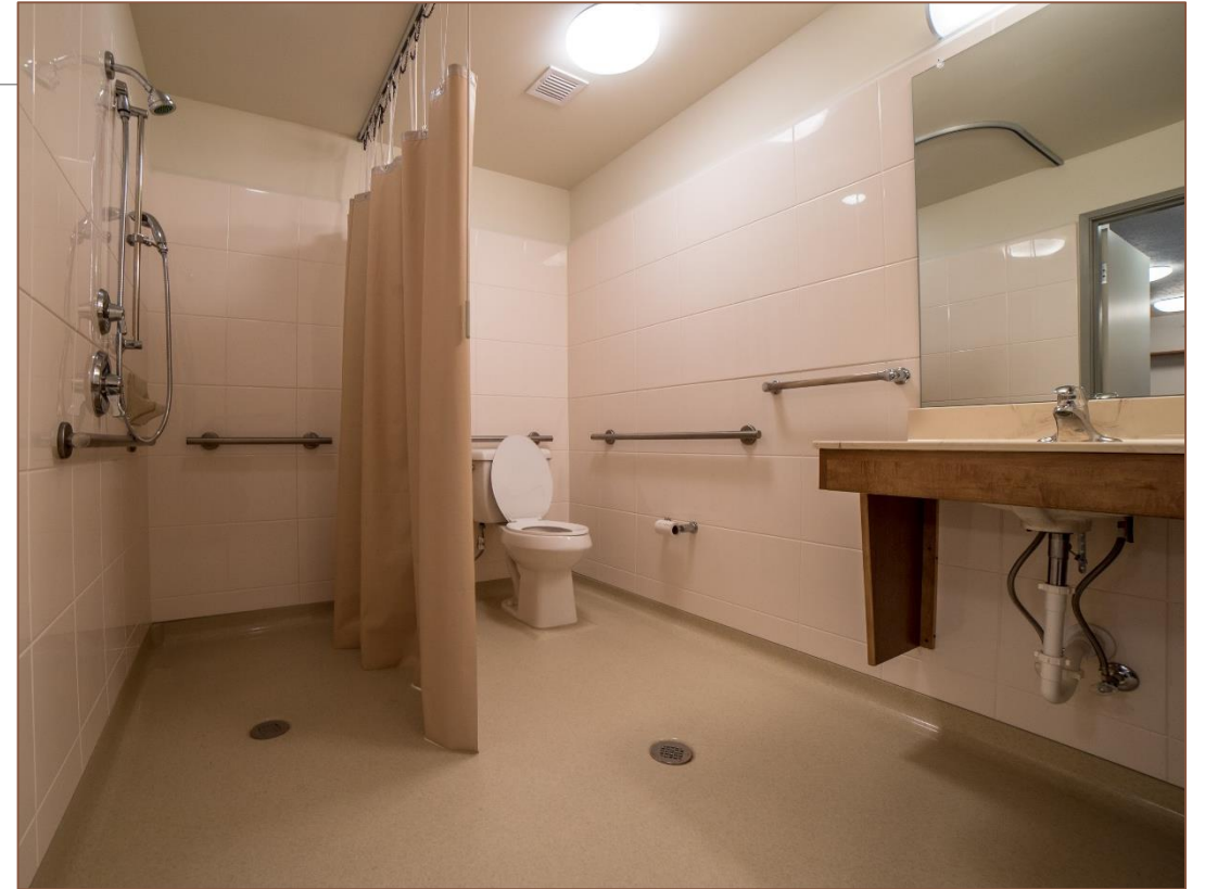
Fully accessible unit