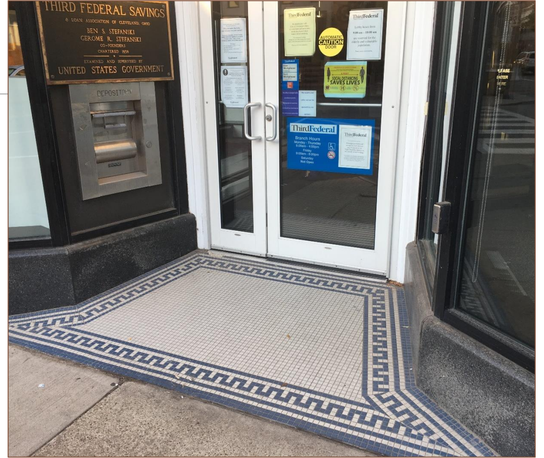
ADA-compliant and inclusive design