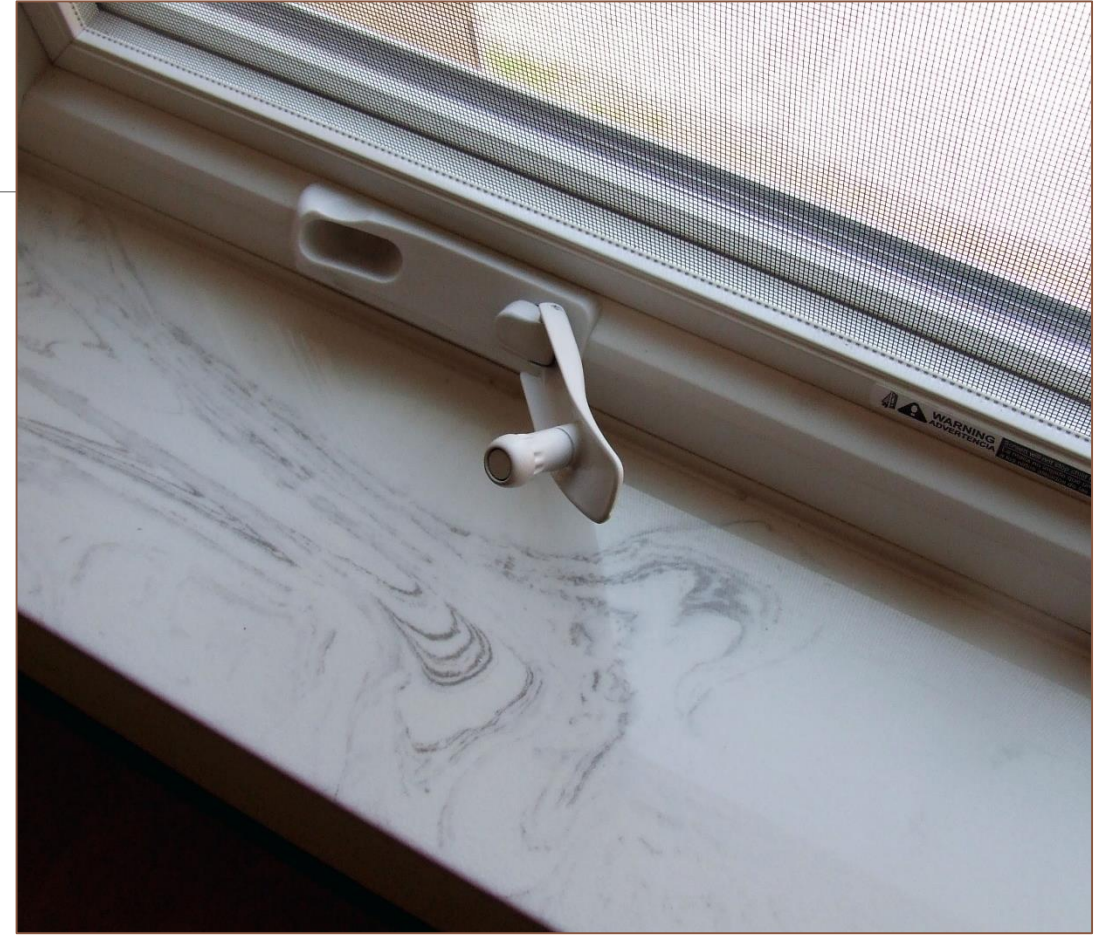
Fully accessible unit