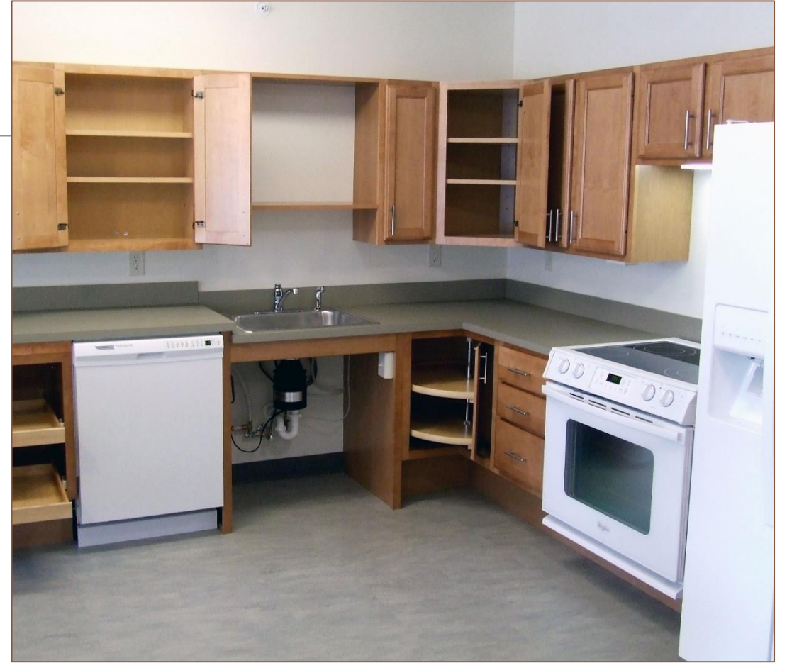
Fully accessible unit